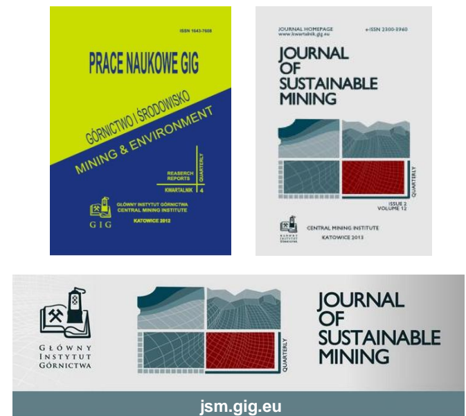
Fig. 1. Cover of the previous title Prace Naukowe GIG. Górnictwo i Środowisko (2002–2012), the cover of Journal of Sustainable Mining , and the banner of the Journal's website

The website is in English and its artwork uses the same motifs as the new cover of the journal (Figure 1).